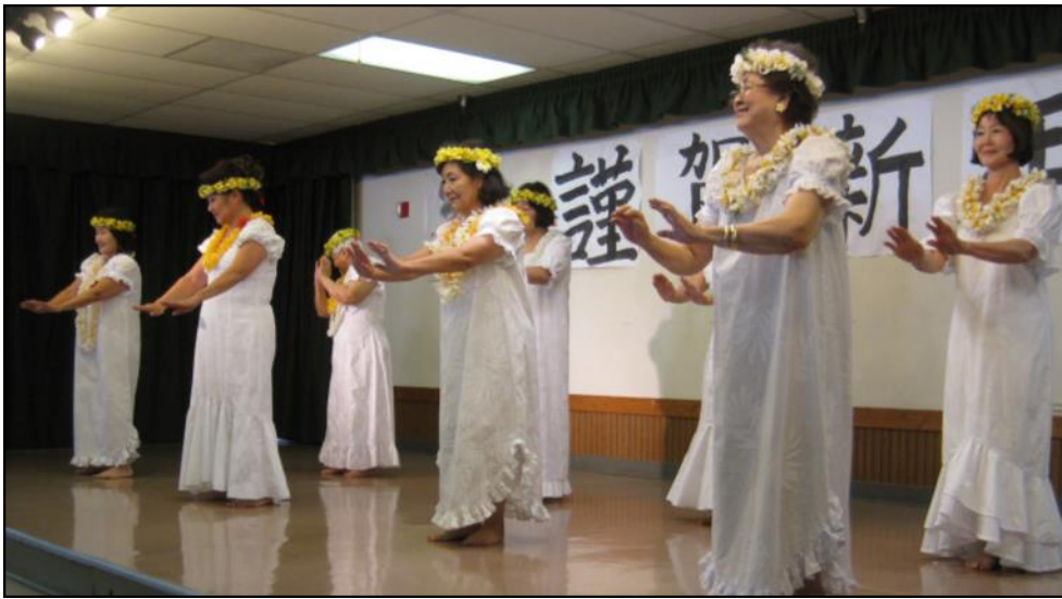
The Hula Wahines, our seniors' hula group, performed two beautiful dances, one with the ipu, a Hawaiian gourd drum.