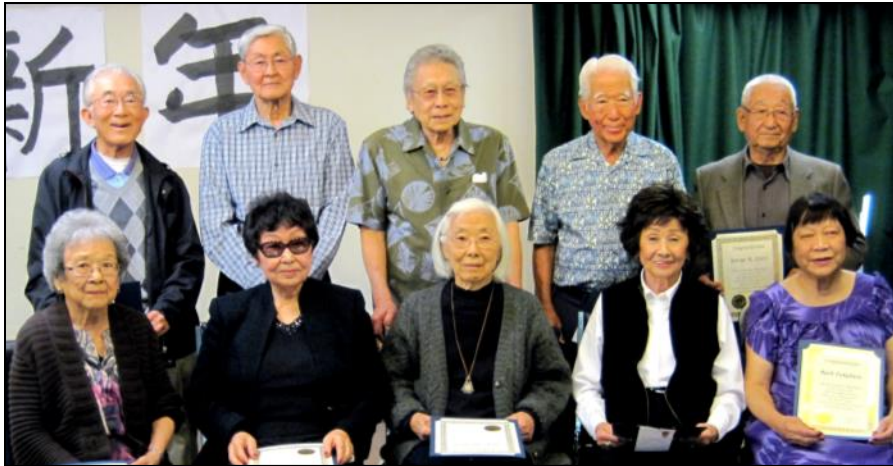
Thirteen seniors were honored into the 85 Year Young Club this year.