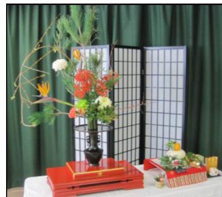
Floral arrangement done by Ritsuko Shinbashi.