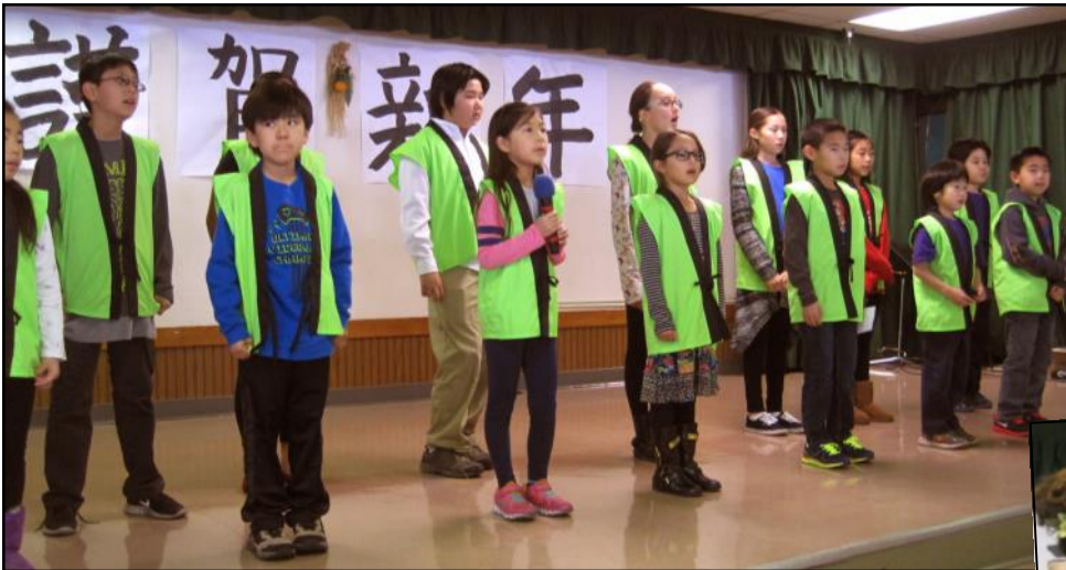
The SFV JACL Suzume no Gakkou Summer Camp students opened our New Year's program with two songs that they had learned at camp