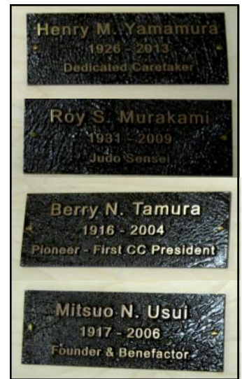
Four past CC members' names were added to the Memorial Plaque this year.