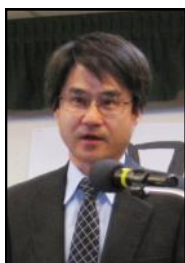
Consul Izuru Shimmura