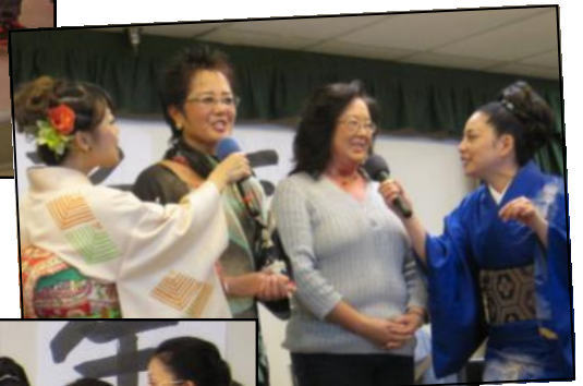
Two CC members helped during one of the songs by singing the chorus.