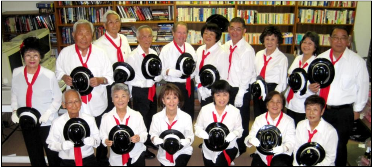
The Line Dancers were part of the entertainment at the Meiji New Year's Party.