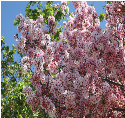
Cherry trees at Lake Balboa.

By noon, the clouds moved in and it got very cold. Everyone enjoyed the hot tea while talking about the good food, beautiful morning, and not having to cook dinner because there was enough food to take home. How perfect is that? I had a wonderful, new experience and enjoyed the company, and I'm sure, everyone else did also.