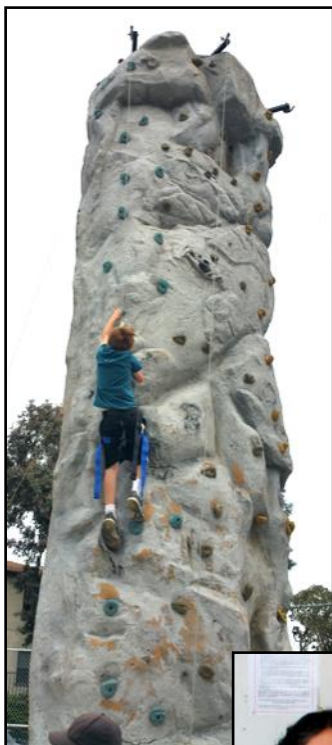
Many braved the Rock Wall Challenge

Acknowledgements on page 4. Scholarship Recipients' Bios on page 5.