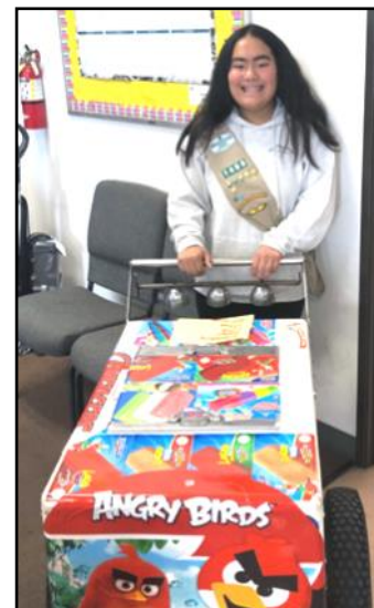
The ever popular ice cream cart.