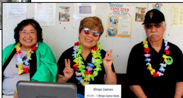
The greeting committee

SFVJACC MISSION STATEMENT To promote the Japanese culture and preserve the Japanese American experience through education, events and activities for our community.