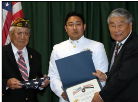
Veterans who attended the service.